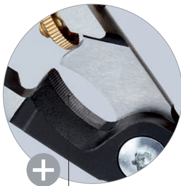
Induction hardened precision blade