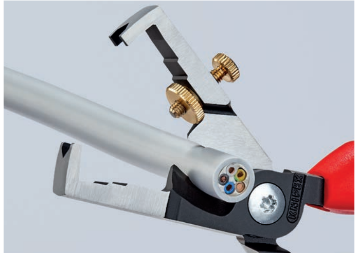
Induction hardened shear blade with precisely ground cutting edges for crushing-free cutting of copper cables up to Ø 15 mm (5 x 2.5 mm 2 )